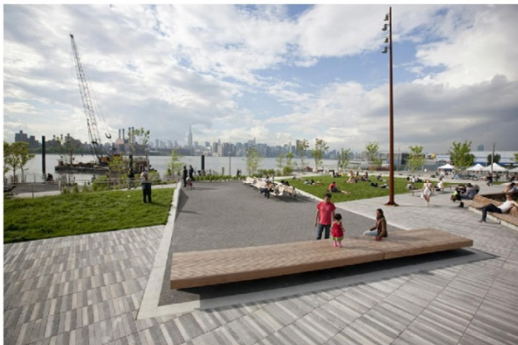
The Edge Park, Brooklyn USA, W Architecture